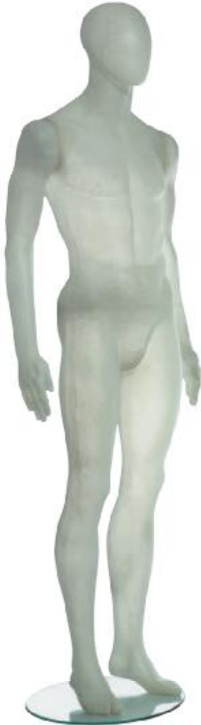
ROMIMFW Male Oval Head