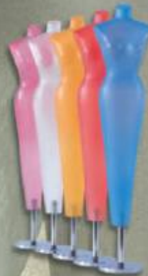
18" Mini Accessory Forms