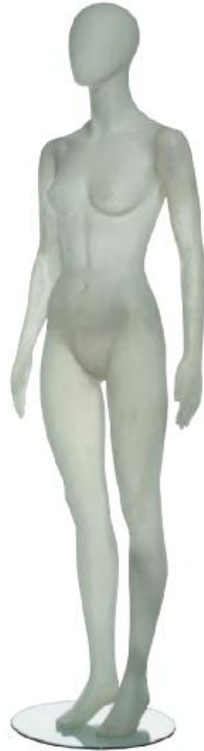
ROFIMFW Female Oval Head White