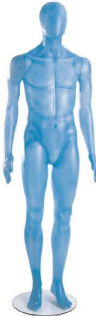
ROMIMFB Male Oval Head